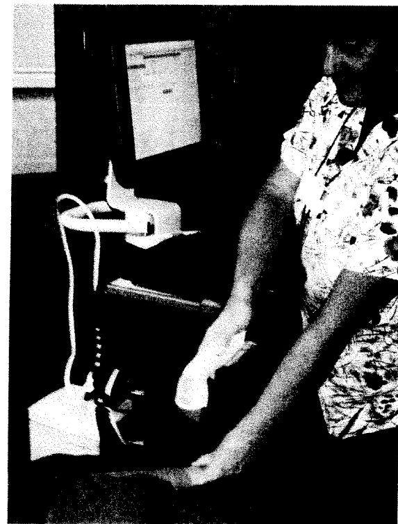
At Right: A Nemaha County Hospital nurse uses the computerized bar coding and scanning system to deliver patient medication.

Our state of the art information system features electronic bedside charting and JCAHO recommended barcoding of medication verification. Our medication delivery system provides many safeguards that ensure your safety.